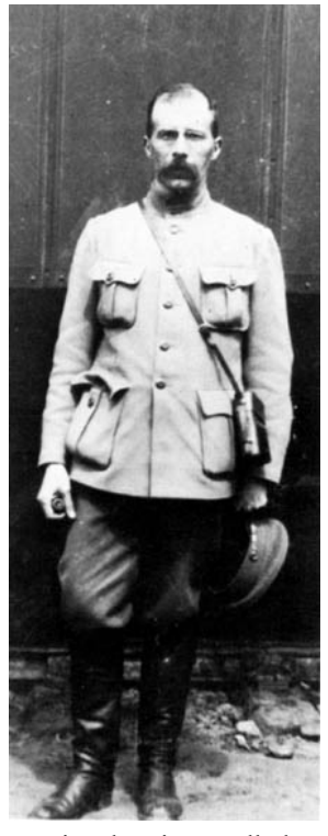
Notice the pipe cradled in his right hand