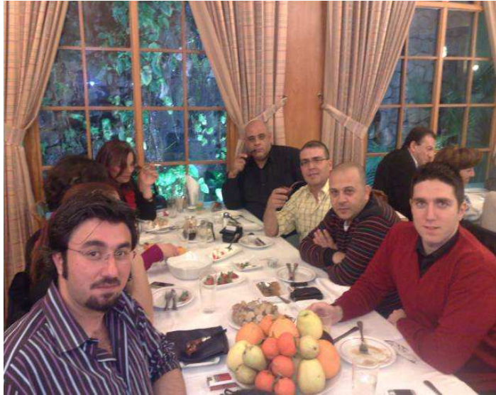
Dessert time. Also the chance to light or re-light our pipes!