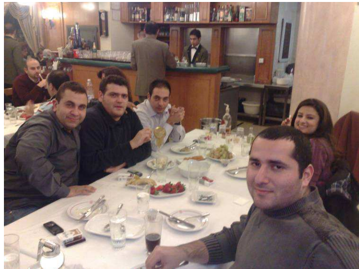
With only a few strawberries and some grapes left, the members are on the verge of exploding...