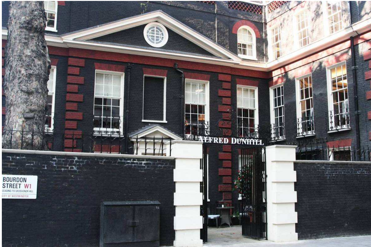
Dunhill's shop on Bourdon street, London

In April of this year, on the occasion of a conference presentation at Nottingham University, UK, I spent a few days with my family in London and, of course, put Dunhill's on the list of "to-visit" items. The last time I was at Dunhill's was in 2000, nine years ago, and I recalled with fondness the walls of the Jermyn street shop filled with big displays containing the best Dunhill pipes.