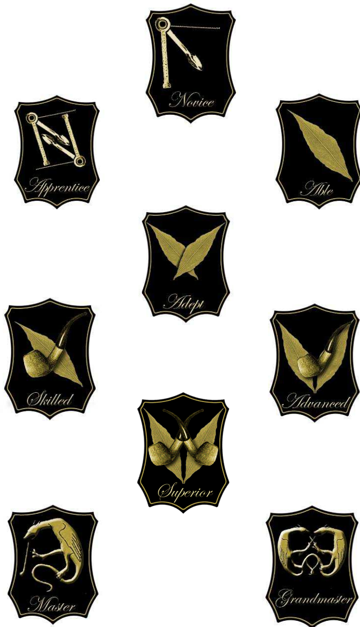
The emblems used for the nine ranks